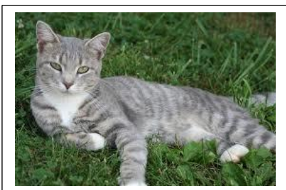
Grey Tiger tabby