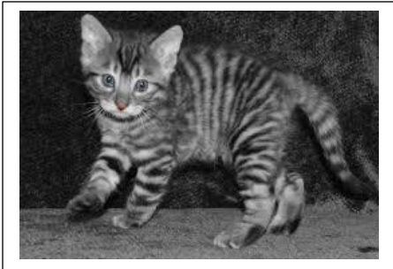
Black tiger tabby

Tiger or Mackerel tabby = striped pattern.