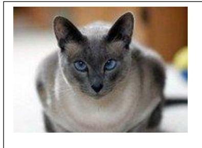
Blue Point (dark grey)