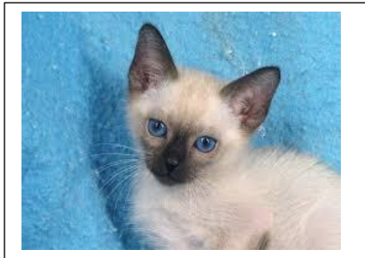
Chocolate Point (brown)

Pointed Colors: Generally have color on their face, feet and tail (points of body).