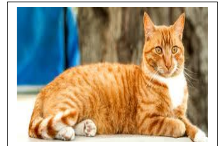
Orange tiger tabby