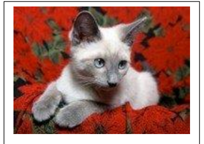
Lilac or Frost Point (very light grey)