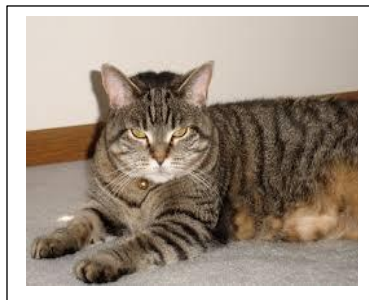
Brown tiger tabby