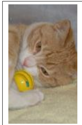
Orange Tabby and White