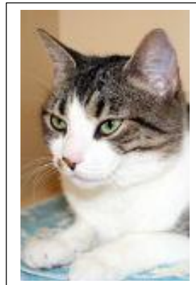
Grey Tabby and White