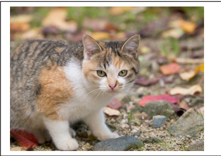
Tiger – calico mix

Calico: Three colors = Black, brown, orange or white.